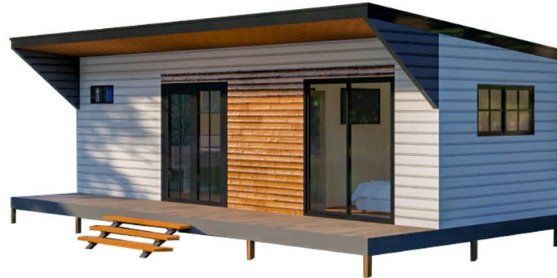
Wave 305 SQ.FT. - 1BD 1BA New Model!