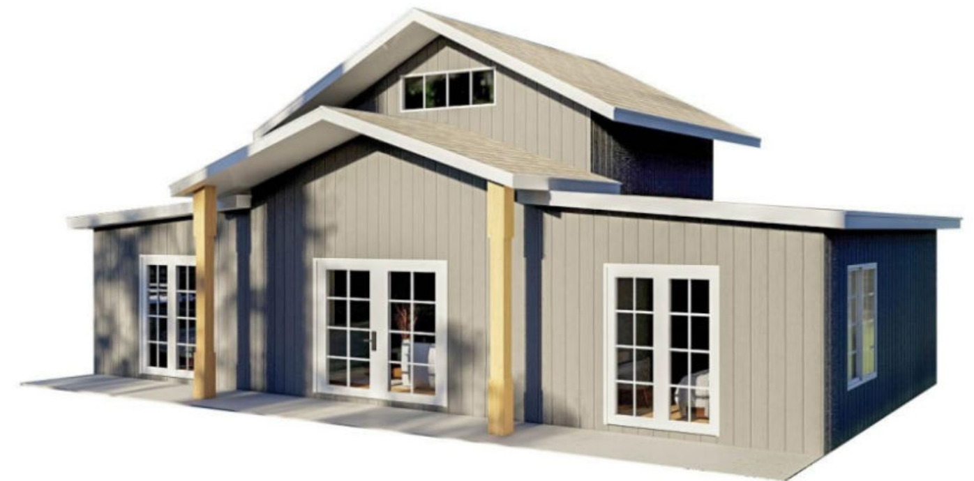
Bungalow Loft 1,017 SQ.FT. 2BD 2BA