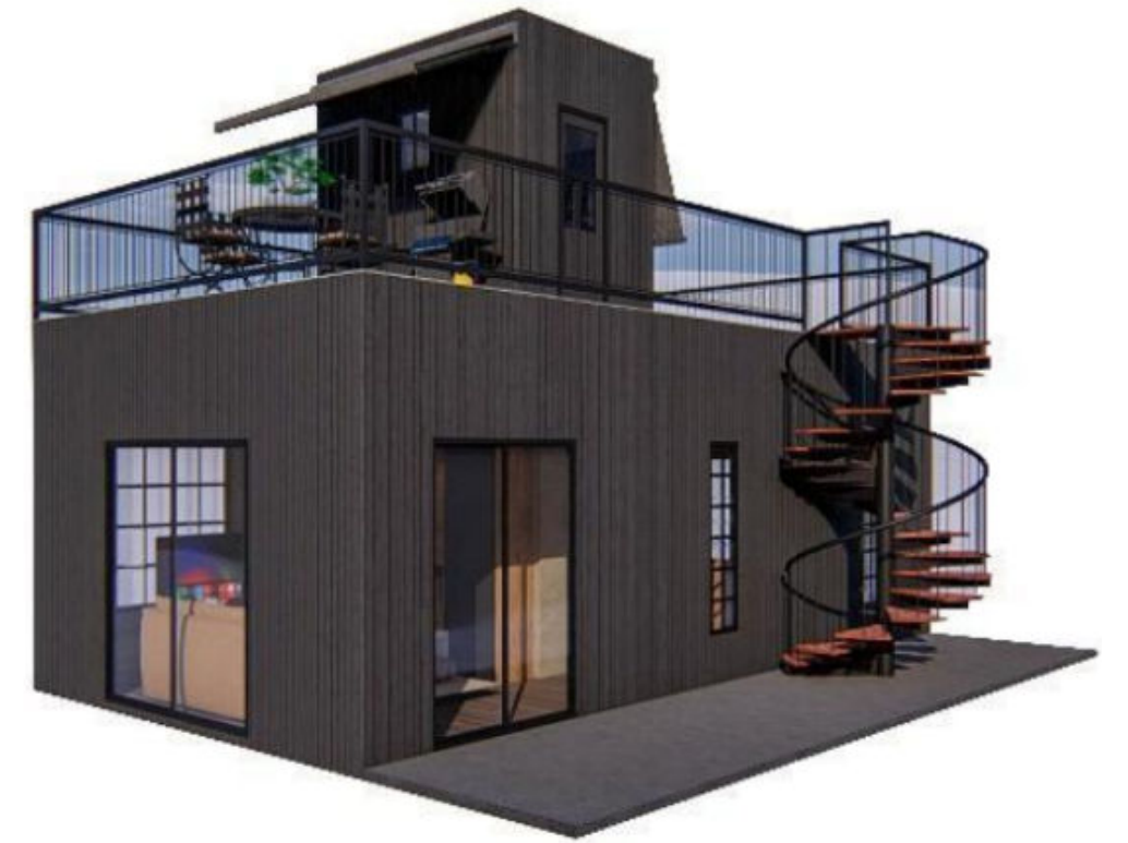
Getaway Pad 620 SQ.FT - 1BD 1BA