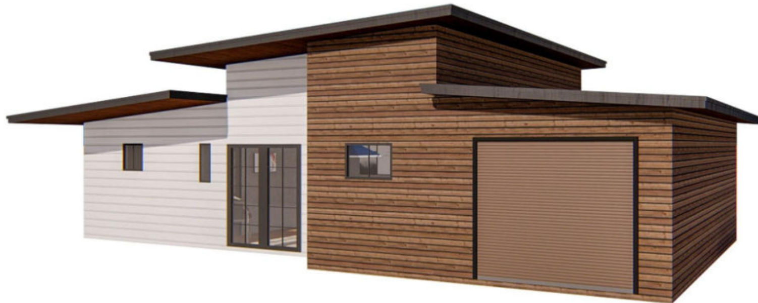
Desert Rose 615 SQ.FT. 2BD 2BA 275 SQ.FT. Garage