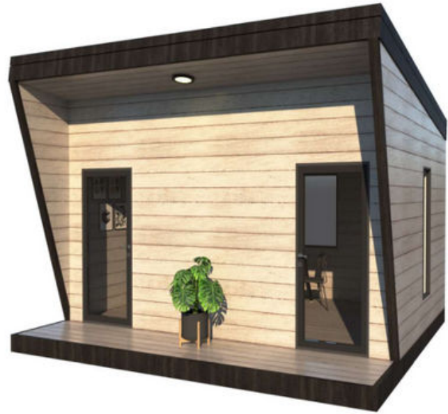
Sedona 140 SQ.FT. - Office